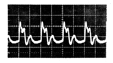
Fig.3 the arc current wave form 0.6[A]/div. 0.5[µS]/div.

Fig.2 the switching voltage wave form. 10[V]/div. 0.5[µS]/div.